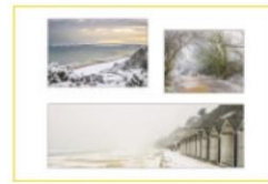
Let it Snow!