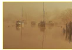
Tuckton in the Mist