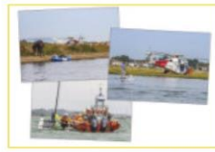
HM Coastguard and RNLI