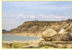
From the Long Groyne