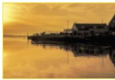
Mudeford Quay Sunset