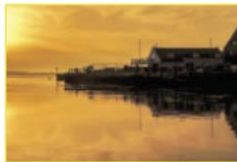
Mudeford Quay Sunset