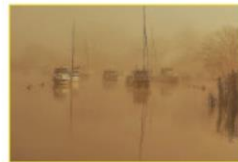
Tuckton in the Mist