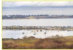
Towards Barton on Sea