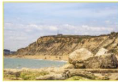
From the Long Groyne