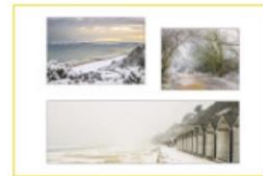
Let it Snow!