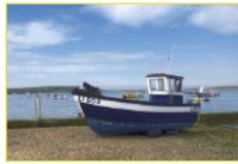
Fishing Boat at Mudeford