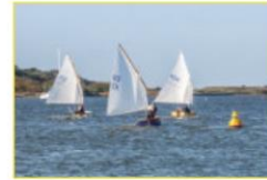
Dinghy Sailing in the Harbour