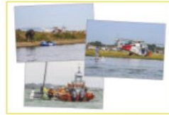
HM Coastguard and RNLI